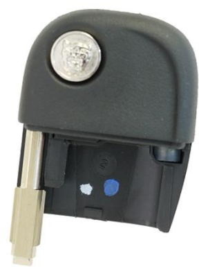
Lower portion of Key Fob

Upper portion of Key Fob with flip out key blade. Notice about 1/8 inch of the transponder showing At the right edge in the middle. It is wrapped in A silicone tube.